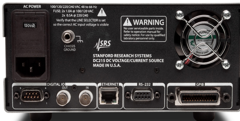
DC215 rear panel