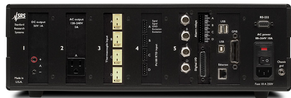
PTC10 rear panel

Macros are a powerful tool that can be used to tailor the behavior of the PTC10 for your experiment. For example, infinite-loop macros running as background tasks can take steps to address alarm conditions, automatically switch between sensor inputs (or heater outputs) depending on the current temperature or other factors, or implement cascade feedback schemes.