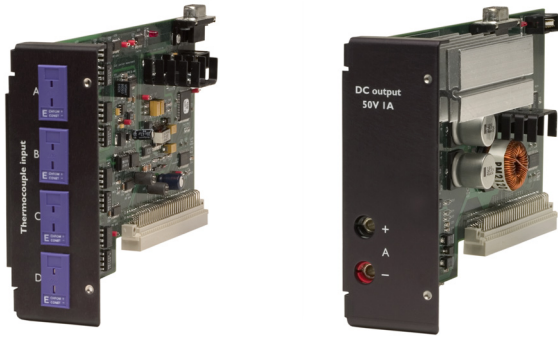
PTC330 Thermocouple Card PTC430 DC Output Card

isothermal block, with its own RTD temperature sensor, provides highly accurate cold junction measurements.