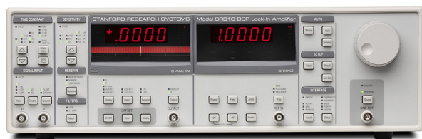
SR810 DSP Single Phase Lock-In Amplifier