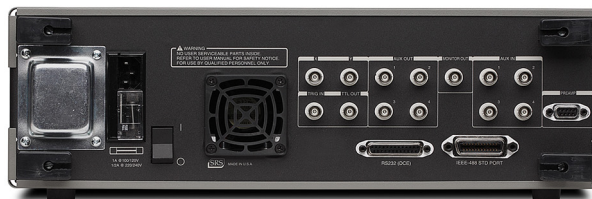
SR810/830 rear panel