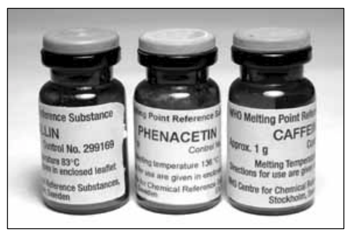
WHO Collaborating Centre for Chemical Reference Substances CRSs

WHO MP standards can also be obtained from LGC Promochem (<a href="www.lgcpromochem.com">www.lgcpromochem.com</a>). LGC Promochem is currently the leading supplier of reference standards in Europe.