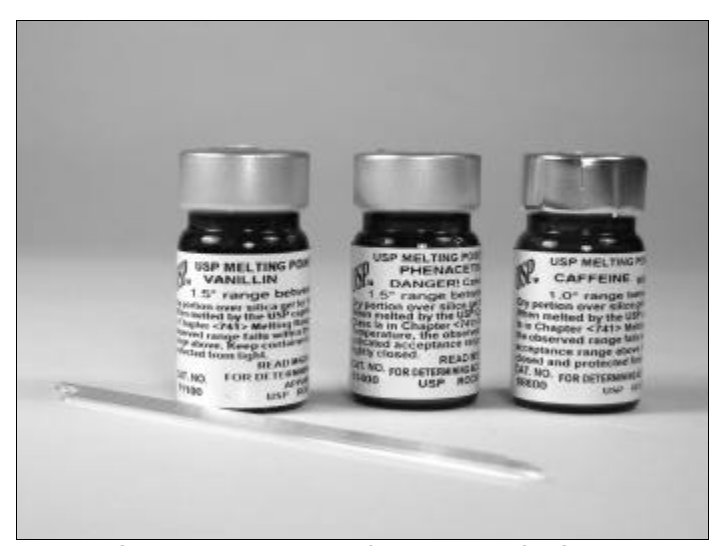
USP Pharmacopeial Convention CRSs.

The US Pharmacopeial Convention is the recommended source of CRSs for US Pharmacopeia protocols. A catalog is available as a download from their website (<a href="https://www.usp.org">www.usp.org</a>).