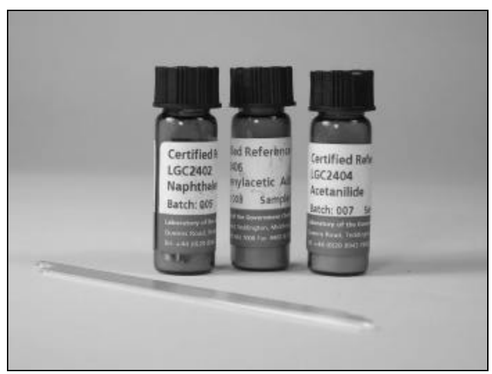
LGC Promochem CRSs