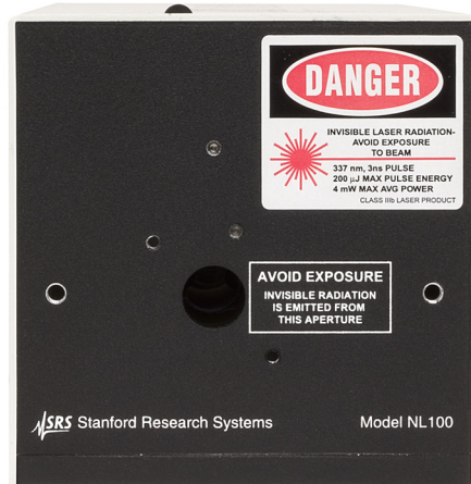
NL100 front panel