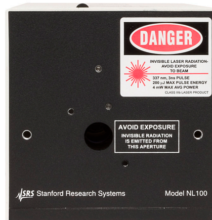
NL100 front panel