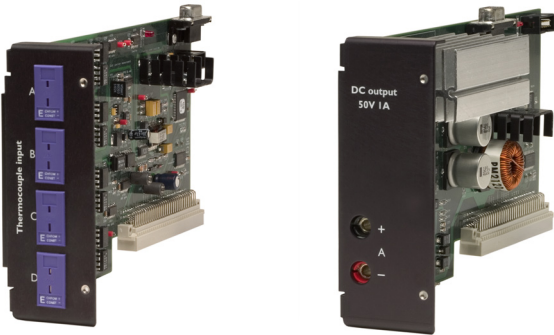
PTC330 Thermocouple Card PTC430 DC Output Card

isothermal block, with its own RTD temperature sensor, provides highly accurate cold junction measurements.