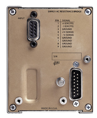
SIM921 rear panel

The rear panel has a standard 9-pin D-sub connector for the sensor. Power and serial communications are via the 15-pin D-sub connector which mates with the SIM900 mainframe. Stand-alone operation of the SIM921 is possible by providing \pm 15 V and \pm 5 V power directly on the 15-pin connector.