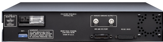
SR640 rear panel