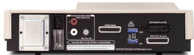
SR720 rear panel

Two rear-panel input connections are provided for an external bias voltage. Voltages as high as 40 VDC can be used. An optional handler interface provides control lines to a component handler for sorting. A standard RS-232 interface allows complete control of all instrument functions by a remote computer. A GPIB interface is included with the handler option.