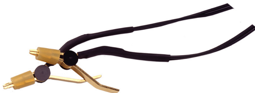
SR726 Kelvin Clips

The SR715 and SR720 support three types of binning schemes: pass/fail, overlapping and sequential. Pass/fail has only two bins: good parts and everything else. Overlapping (or nested) bins have one nominal value and are sorted into progressively larger bins (e.g., \pm 1\% , \pm 2\% , \pm 3\% ). Sequential