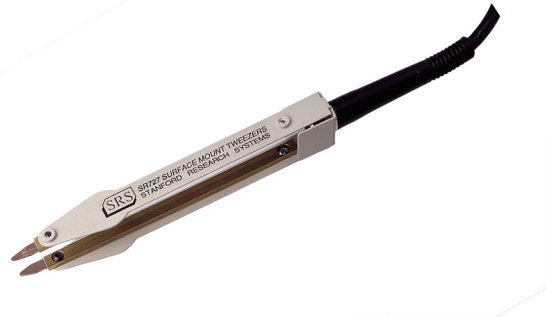
SR727 Surface Mount Tweezers

The SR715 and SR720 have a kelvin fixture which uses two wires to carry the test current and two independent wires to sense the voltage across the device under test. This prevents the voltage drop in the current carrying wires from affecting the voltage measurement. Radial components are simply inserted into the test fixture, one lead in each side. Axial devices require the use of the axial fixture adapters (provided). Surface-mount devices, or components with large or unusually shaped leads, can be measured with optional SMD Tweezers (SR727) or Kelvin Clips (SR726). The tweezers and clips attach directly to the LCR meter's front-panel test fixture. An optional BNC Fixture Adapter (SR728) allows you to connect a remote fixture or other equipment through one meter of coaxial cable.