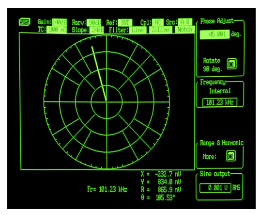
Polar plot display

defining an appropriate trace. Trace values can be displayed as a bar graph with an associated large numerical display, or as a strip chart showing the trace values as a function of time. Additionally, you can display polar plots showing the phasor formed by the in-phase and quadrature components of the