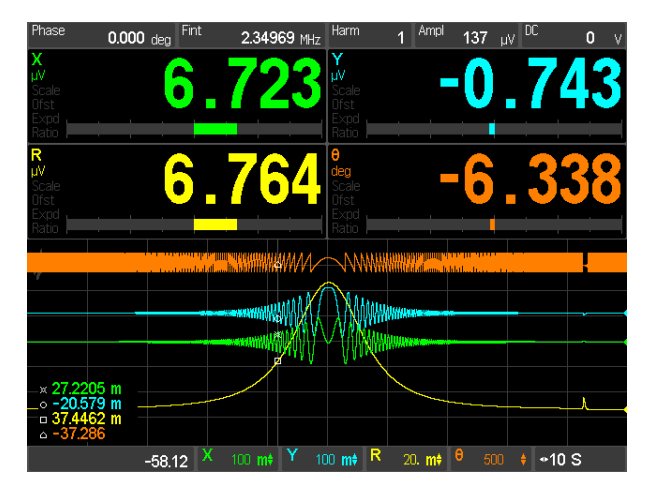
Large numeric readout with strip chart recording

The SR865A's effective dynamic reserve is simply the ratio of these two settings. For instance with a 10 nV sensitivity setting and a 300 mV input range the effective dynamic reserve of the SR865A is 3 \times 10^7 , or nearly 150 dB.