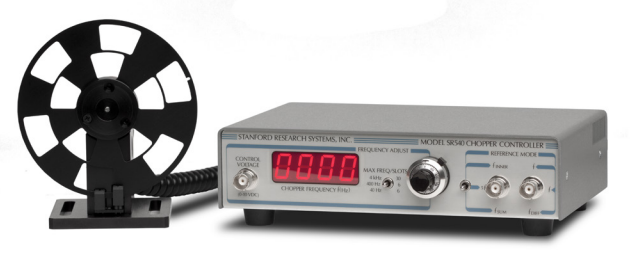
SR540 Optical Chopper

Synchronous filtering may also be selected at reference frequencies below 4 kHz. The synchronous filter notches out multiples of the reference frequency and is extremely useful in making low frequency measurement where multiples of the reference frequency would otherwise show up in the lock-in output. Unlike previous designs the synchronous filter in the SR865A can be selected with no loss of output resolution.