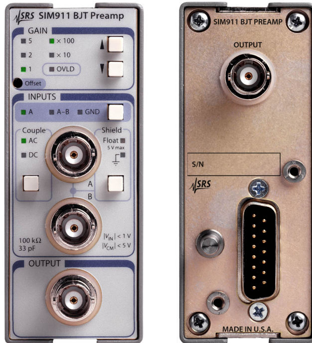
Figure 1.2: The SIM911 front and rear panel.

gain settings, the overload light, the input settings, the coupling and the shield states, and the buttons to control them.