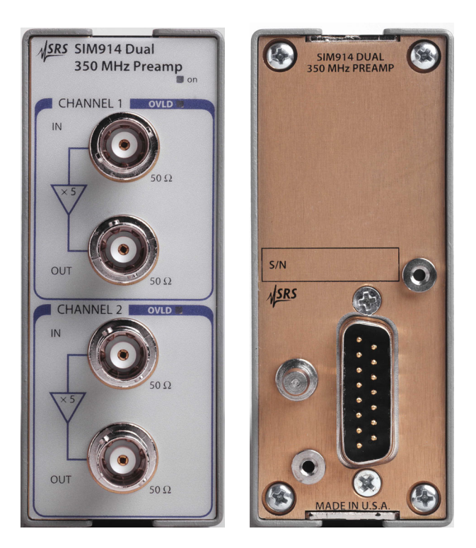
Figure 1.1: The SIM914 front and rear panels.

The SIM914 is a two-channel, 350 MHz bandwidth, DC-coupled, 50 \Omega amplifier with a gain of 5× (+14 dB). The two channels may be cascaded for a gain of 25× (+28dB). The unit uses BNC connectors for inputs and outputs (see Figure 1.1). A rear panel DB-15 connector provides power to the unit.